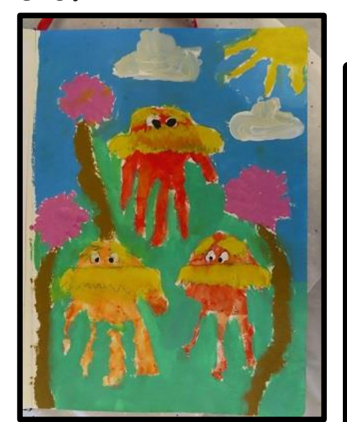
3 - 5 yr. old: Marissa Picazo